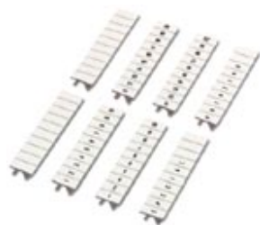
Zack marker strip, 10-section, horizontally labeled with the consecutive numbers: 11 ... 20, white, width: 5 mm

Please be informed that the data shown in this PDF Document is generated from our Online Catalog. Please find the complete data in the user's documentation. Our General Terms of Use for Downloads are valid ( http://phoenixcontact.com/download )